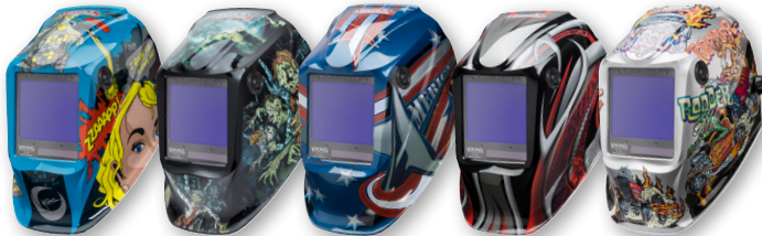
Jessi vs. The Robot™ K3372-4